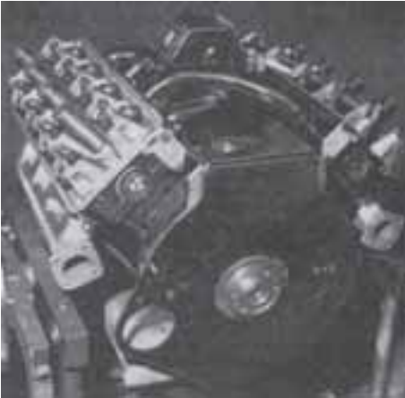
Carrying the rocker shafts are diecast aluminium pedestals, secured by the cylinder head nuts and located by sleeve dowels. The risers of the aluminium divided type induction manifold are both jacketed.

In view of the different duties for which the two units were designed, there is a major variation in respect of the air cleaning and silencing arrangements. Each carburettor of the SP.250 carries an AC pancake type filter with an oil-wetted woven wire element. In contrast, the intakes of the carburettors of the DQ.450 are fitted with cast aluminium elbows leading to a large-diameter but shallow Cooper filter with a paper element. This filter embodies two pairs of short silencing tubes, one pair at each side. It is mounted above the engine, immediately ahead of the carburettor dashpots. In both engines each rocker gear cover vents into the air filter.