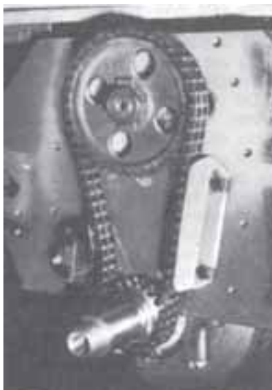
The \frac{3}{8} in pitch duplex chain of the camshaft drive runs on 19-tooth and 38-tooth sprockets. It is tensioned by a Renold SCD automatic adjuster, and a nylon anti-whip bracket is mounted close beside the strand under load.

In the section dealing with the crankcase and cylinder casting, mention was made of the separate aluminium tappet block. This block has a cross section approximating to a letter W; the outboard arms terminate