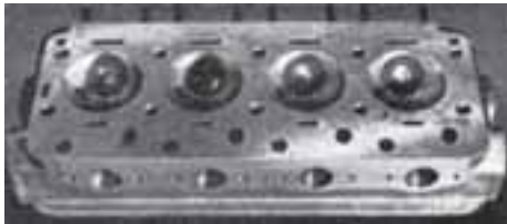
The iron valve seats are cast into the aluminium head, and the part-spherical combustion chambers are, of course, fully machined. There is an included angle of 70 deg between the stems of the valves, and it is bisected by the cylinder axis.

An ordinary cast iron is employed for the cast-in valve seats, which have a slightly dovetailed section to ensure their complete security. The inlet and exhaust valves of each cylinder are disposed in a transverse plane through the cylinder axis, which bisects the 70 deg included angle between the valve stems. Because of the small gap between the valve seats, the sparking plug holes are offset longitudinally from the cylinder axes, to which they are parallel; for internal symmetry in relation to the porting, the direction of offset is forward on the left-hand bank and rearward on the other.