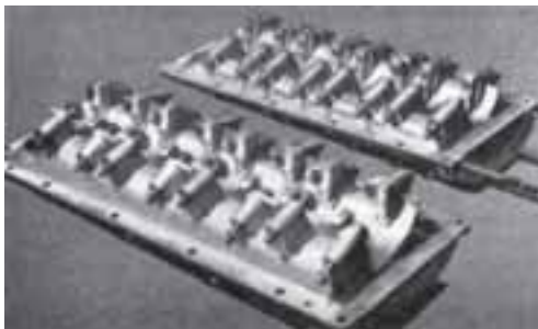
The hollow tappets are common to both engines, and their block is bolted between the cylinder banks: whereas the tappets of the SP.250 unit are in line, those of the DQ.450 are alternately inclined.

In the accompanying table are the principal data for the valves and springs of both engines. The head of the inlet valve is of tulip shape,