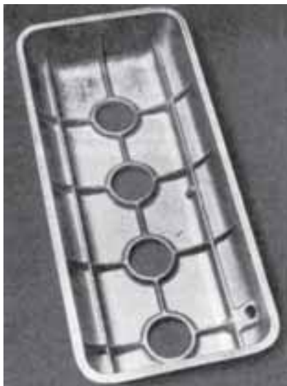
The diecast aluminium covers for the rocker gear are stiffened by internal ribs; each is secured by four hand nuts, screwed on the sparking plug tubes.

With the exception of the sparking plugs, the electrical equipment is all of Lucas manufacture. As has already been mentioned, the model 20D8 type BS distributor is mounted vertically at the rear of the engine, between the cylinder banks. It was specially developed by Lucas for these engines. Because the high firing frequency of an eight-cylinder engine results in a very short build-up period for the flux, the distributor has an 8-lobe cam and twin contact assemblies, one of which breaks the primary circuit and the other makes it. On both engines, the distributor incorporates vacuum and centrifugal automatic advance devices, but the actual characteristics are not the same. The basic timing is 10 deg before t.d.c.